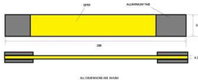
Figure: 1 ASTM D3039 Standard

The laminates are prepared using compression moulding machine and cured at room temperature at 100 bar pressure for 24 hours. After curing the specimens are prepared as per ASTM D3039 standard. Water jet cutting machine is used to cut the specimens in required dimensions from the laminate. The specimens are subjected to tensile test in INSTRON 3367 universal testing machine under acoustic emission monitoring using the 8-channel acoustics setup supplied by physical acoustics corporation [4].